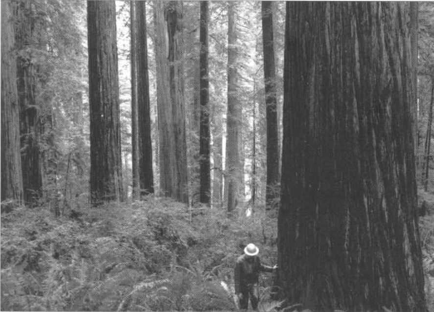
Figure I 95-Yurok, redwood overstory and the dense, lush understory vegetation in the Yurok RNA. (around 1976)

Red Alder-Rubus spectabilis (61130, 81A00): This type occurs along the alluvial soils adjacent to High Prairie Creek. Trees are primarily red alder and bigleaf maple in about equal proportions. Port Orford-cedar ( Chamaecyparis lawsoniana ) is a subdominant. Shrub understory is dense and dominated by deciduous species such as Rubus spectabilis , R. parviflorus , Sambucus callicarpa , and Menziesia ferruginea . Herbaceous cover is mostly dominated by Polystichum munitum , Blechnum spicant , Equisetum laevigatum , and Epilobium angustifolium . Other characteristic species include Salix lasiolepis , Myrica californica , Polypodium scouleri , and Mimulus dentatus . Polypodium scouleri and P. glycyrrhiza often occur as epiphytes on mossy bigleaf maple trunks.